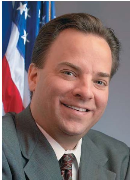
Dr. Mark McClellan

Yesterday, the Keynote Presentation, The Great Election Divide: What's on the Health Care Ballot in 2004? , was presented